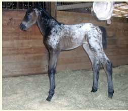
Macarn Farm's second generation of Knabstrupper foals began with the birth of Tzarina by Apollon on March 28, 2006.

Cassel Rock Trakehners welcomes three new foals: