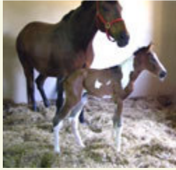
Silver Creek Farms newest is the lovely Sempatico colt, Sudoku.