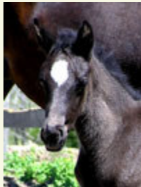
Fiana, by Tanzeln out of Fun 'n Games by Fabius, black 3/4 trakehner filly born 3/26/06.