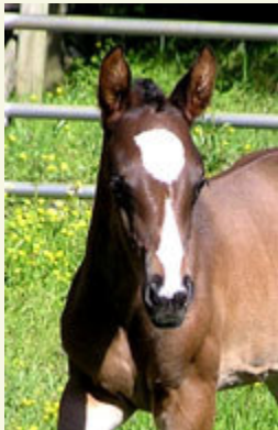
Resonance, by Tanzeln out of Riante by Sigurd dark bay trakehner colt born 4/14/06 (3 weeks early).

exposure planned, this is a GREAT time for member breeders to list their horses for sale on our FREE website listings! Please get them in!