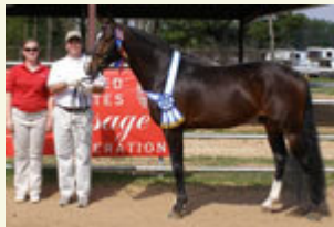
Silver Creek's stallion, Vallado, was Champion Mature Stallion and High Scoring at the Arkansas show!