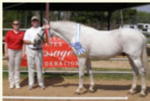
Right behind him was Silver Lining as Reserve Champion Mature Stallion at the Arkansas Show and Reserve Champion Special Hunter at the Tulsa Spring Go Show.